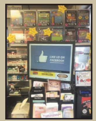
Kwik Stop #1, North Platte

Each retailer has a different setup when it comes to lottery tickets and materials. If your display is clean and in view of the customer, they're more likely to purchase tickets along with other items. Here are some ticket display examples. If you're interested in revising your display, contact your LSR to discuss the options available to you.