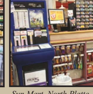
Sun Mart, North Platte