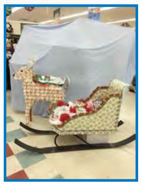
McKinney's in Gretna – reindeer/sleigh