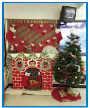
Casey's in Eagle – "Dough, Dough, Dough, Merry Christmas/fireplace"