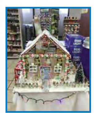
2. Taylor Quik Pik in Lousiville – ginger bread house