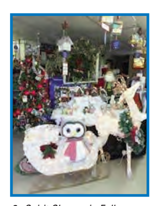
3. Spirit Shoppe in Falls City - (village throughout store)