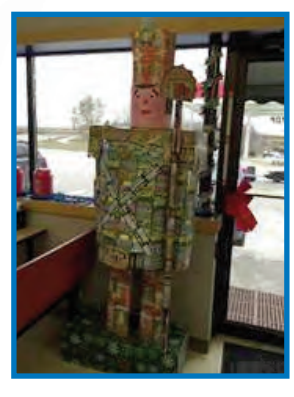
2. Tag's One Stop in Nebraska City – life-size nutcrackers