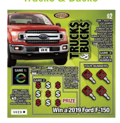
Truck$ & Buck$

A pack activation promotion was used to encourage stores to activate their monthly ticket shipments. Between March and July 2019, stores that activated and displayed at least one pack of each game from their monthly shipment the first week of the distribution were entered into a drawing. Ten retailers were drawn each month to win $100.