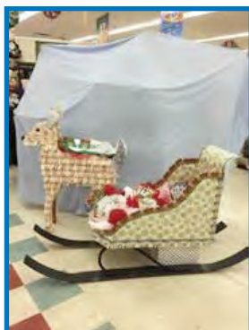
1. McKinney's in Gretna – reindeer/sleigh