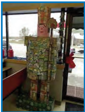
2. Tag's One Stop in Nebraska City – life-size nutcrackers