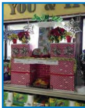
3. No Frills in Plattsmouth – “What’s in your stocking?” Fireplace/snowflakes