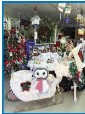
3. Spirit Shoppe in Falls City - (village throughout store)