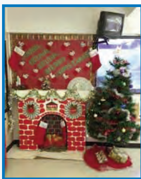
1. Casey's in Eagle – “Dough, Dough, Merry Christmas/fireplace”