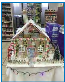
2. Taylor Quik Pik in Louisville – ginger bread house