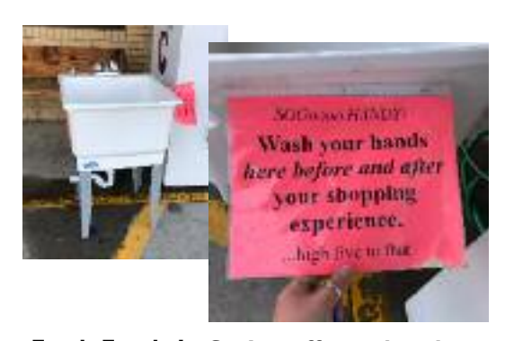
Fresh Foods in Gering offers a handwashing station for customers. Handy!