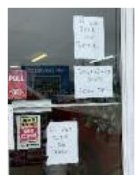
Customers at the Whiskey Barrel in Broken Bow can make purchases with the press of a button.