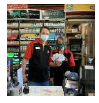
Casey's General Store in Ord is ready to sell another big winning ticket.