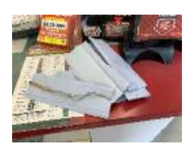
An 80-year-old man in Guide Rock created these temporary masks for shoppers at Country Corner.