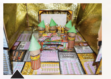
It's all in the details for the employees of Casey's in Springfield, who created this scene of elves opening presents around a warm fire.

Does your store have a holiday decoration featuring Nebraska Lottery tickets? Send photos to lottery@nelottery.com. We'll upload them to a Flickr album and share on our Facebook page for all to see!