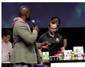
Host Akbar Gbaja-Biamila

The first few elimination rounds showed the level of skill on display. Hands blurred as they quickly but gently packed cereals, oatmeal, cans of pop, Jell-o pudding, pickles, Rice-A-Roni, Flamin' Hot Cheetos, canned green beans and, every bagger's nightmare, a dozen eggs, making sure all the groceries would make it home in one piece.